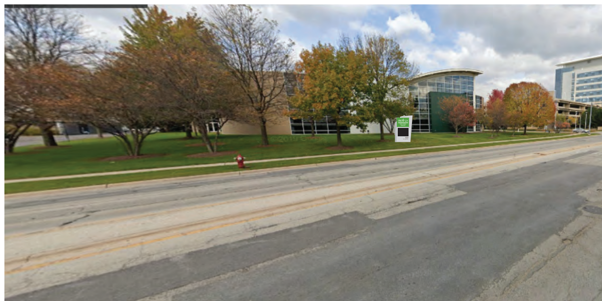
Proposed location for new sign