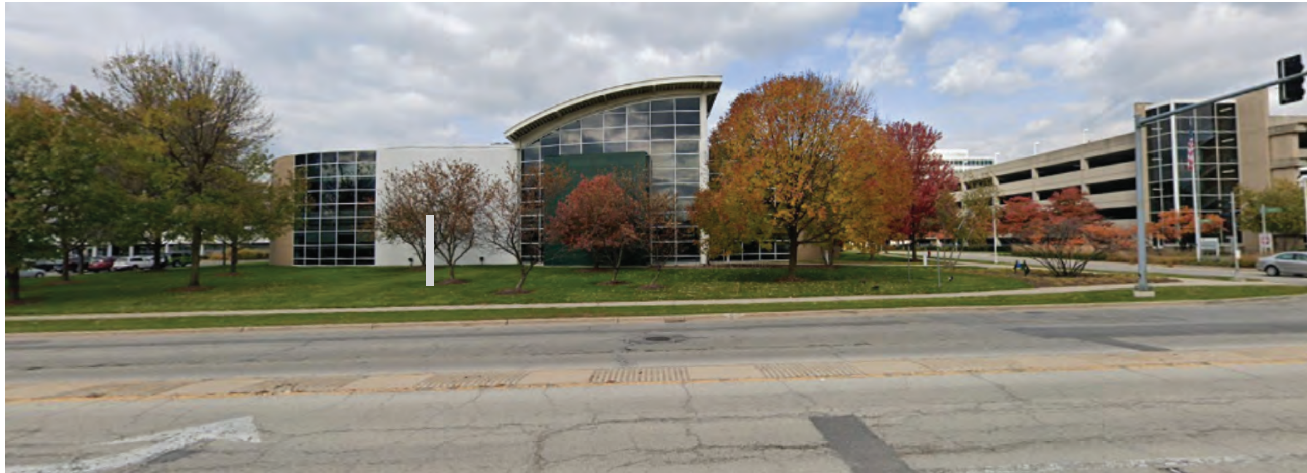
Proposed location for new sign