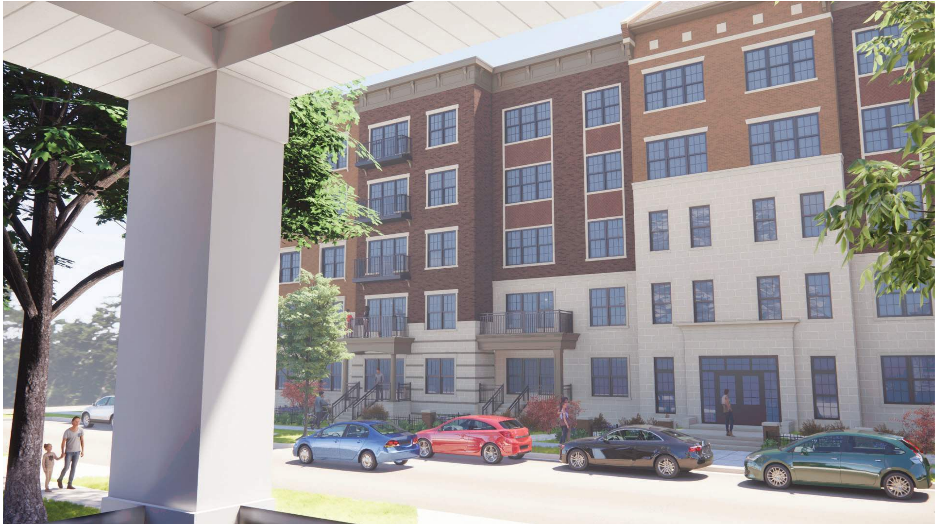
HOME OWNER'S CONNECTION TO CHESTNUT; VIEW LOOKING EAST FROM PORCH