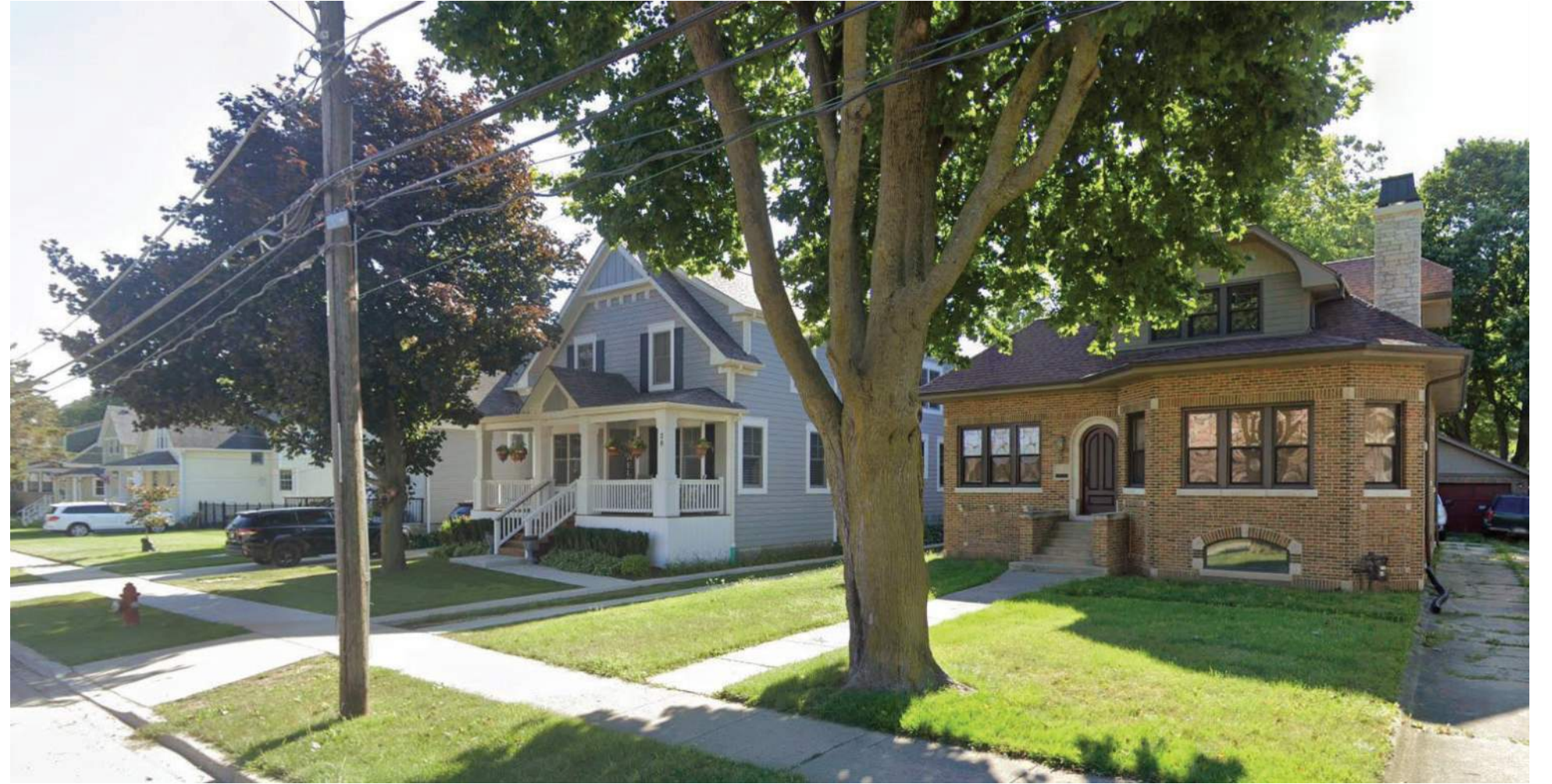
HOMES DIRECTLY WEST OF PROPOSED 5 STORY APARTMENT BUILDING