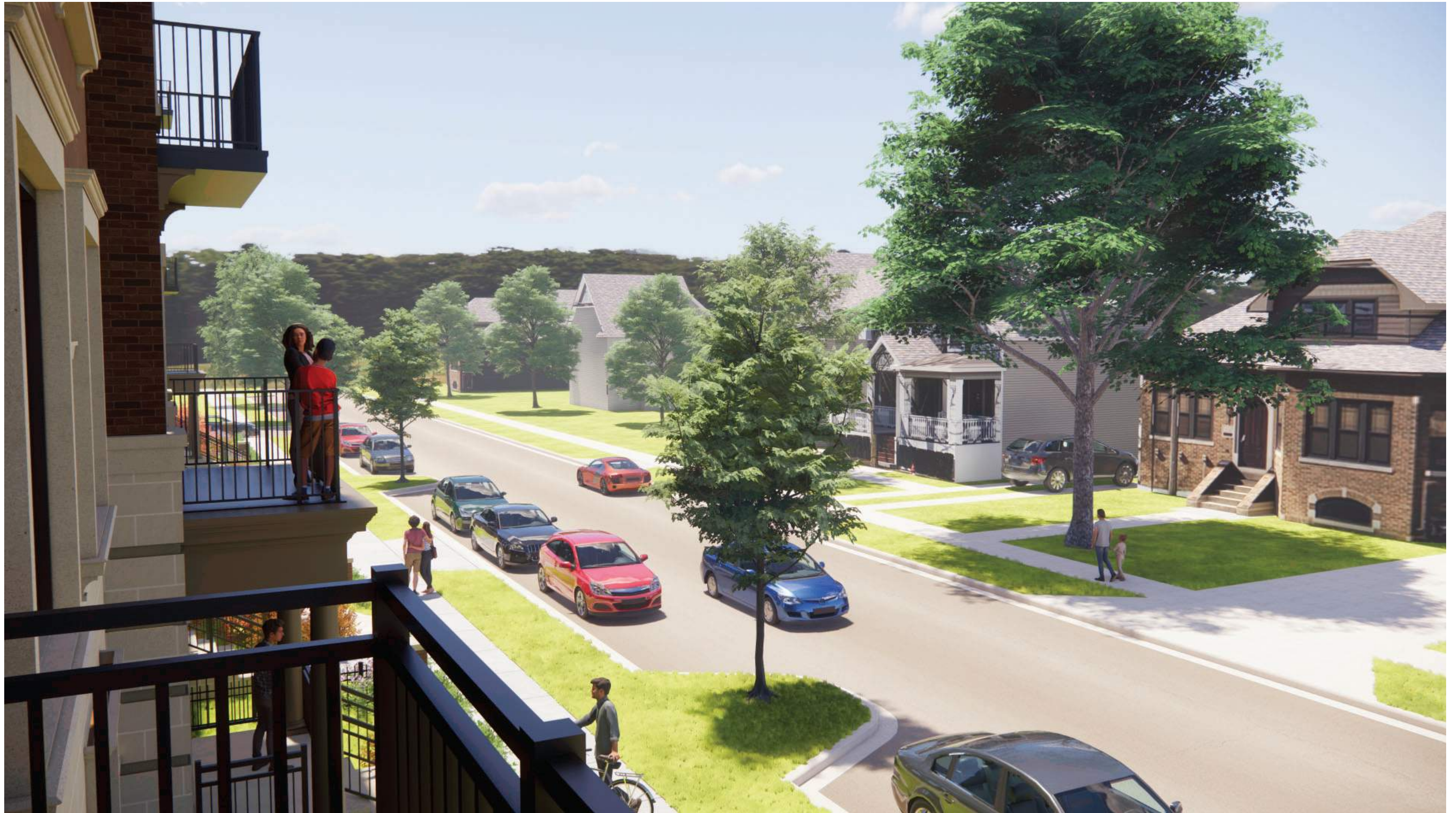
APARTMENT OCCUPANTS CONNECTION TO CHESTNUT; BALCONY VIEW FROM 2ND FLOOR APARTMENT LOOKING SOUTH