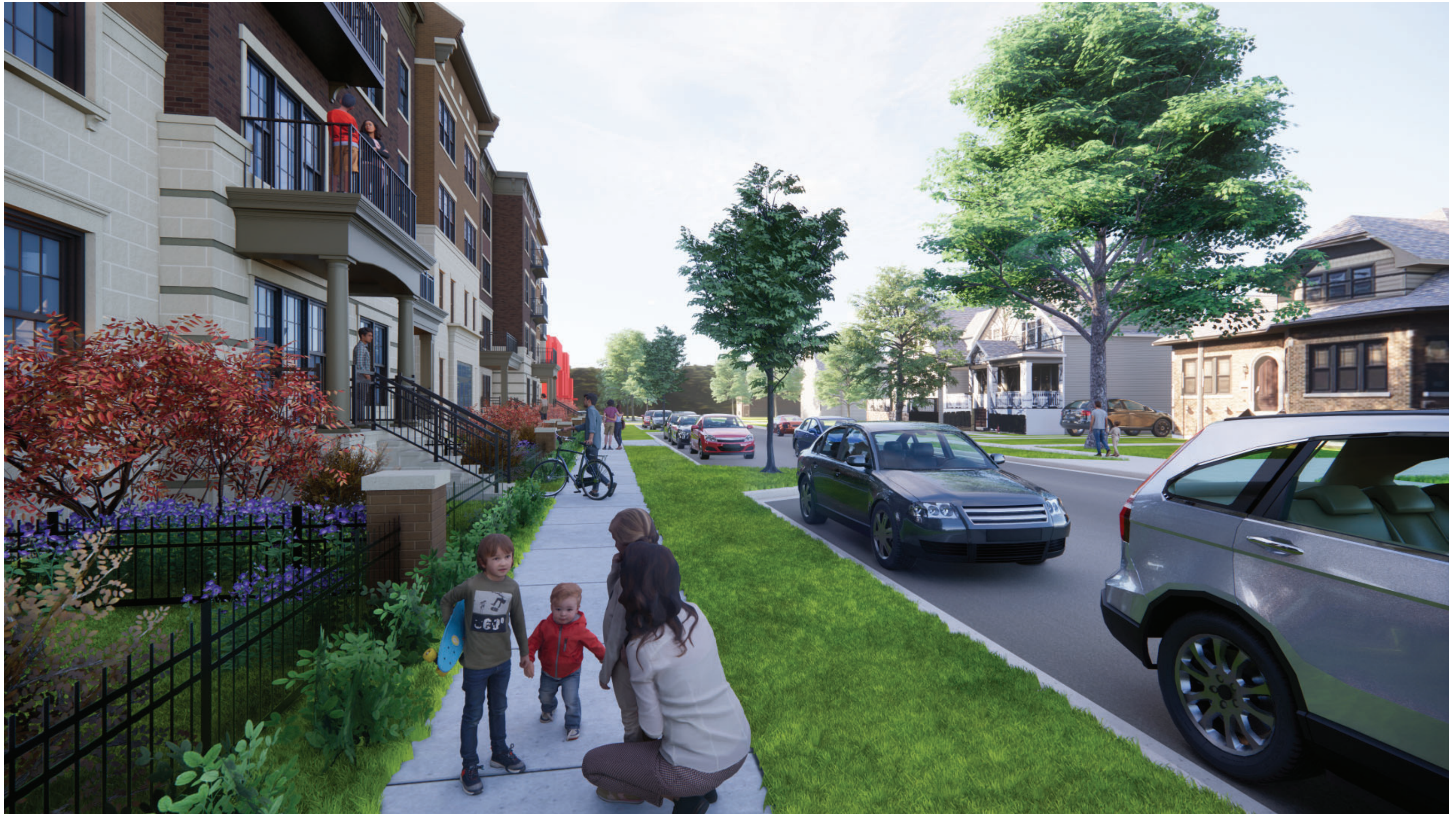
SIDEWALK VIEW LOOKING SOUTH ON CHESTNUT (3 STORY SIGWALT 16 ROW HOMES IN RED BEYOND)