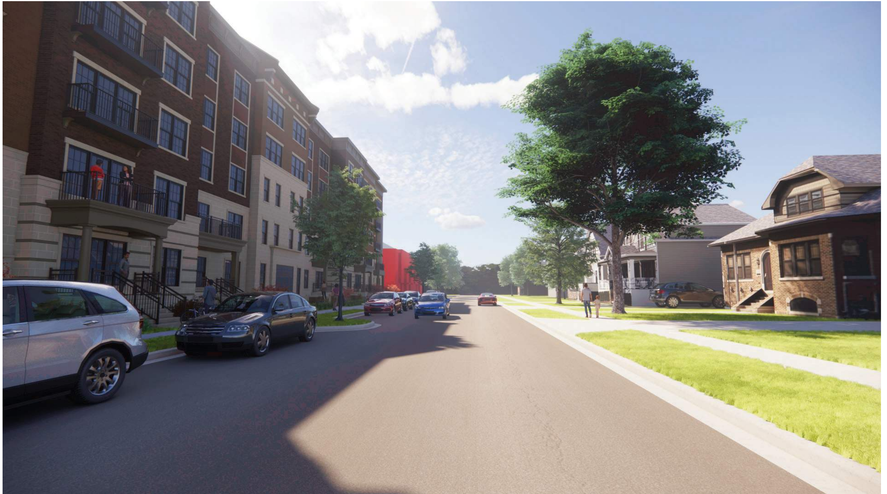
VIEW LOOKING SOUTH ON CHESTNUT T (3 STORY SIGWALT 16 ROW HOMES IN RED BEYOND)