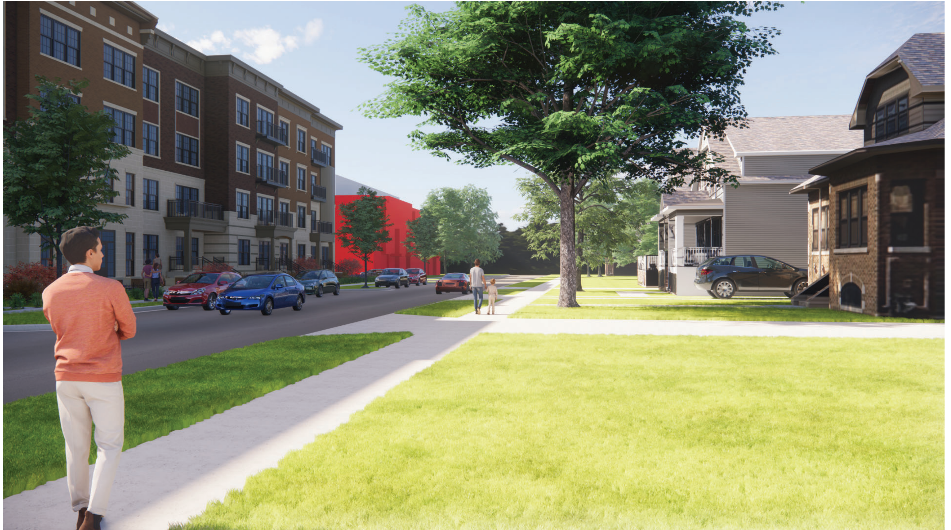
SIDEWALK VIEW LOOKING SOUTH ON CHESTNUT (3 STORY SIGWALT 16 ROW HOMES IN RED BEYOND)