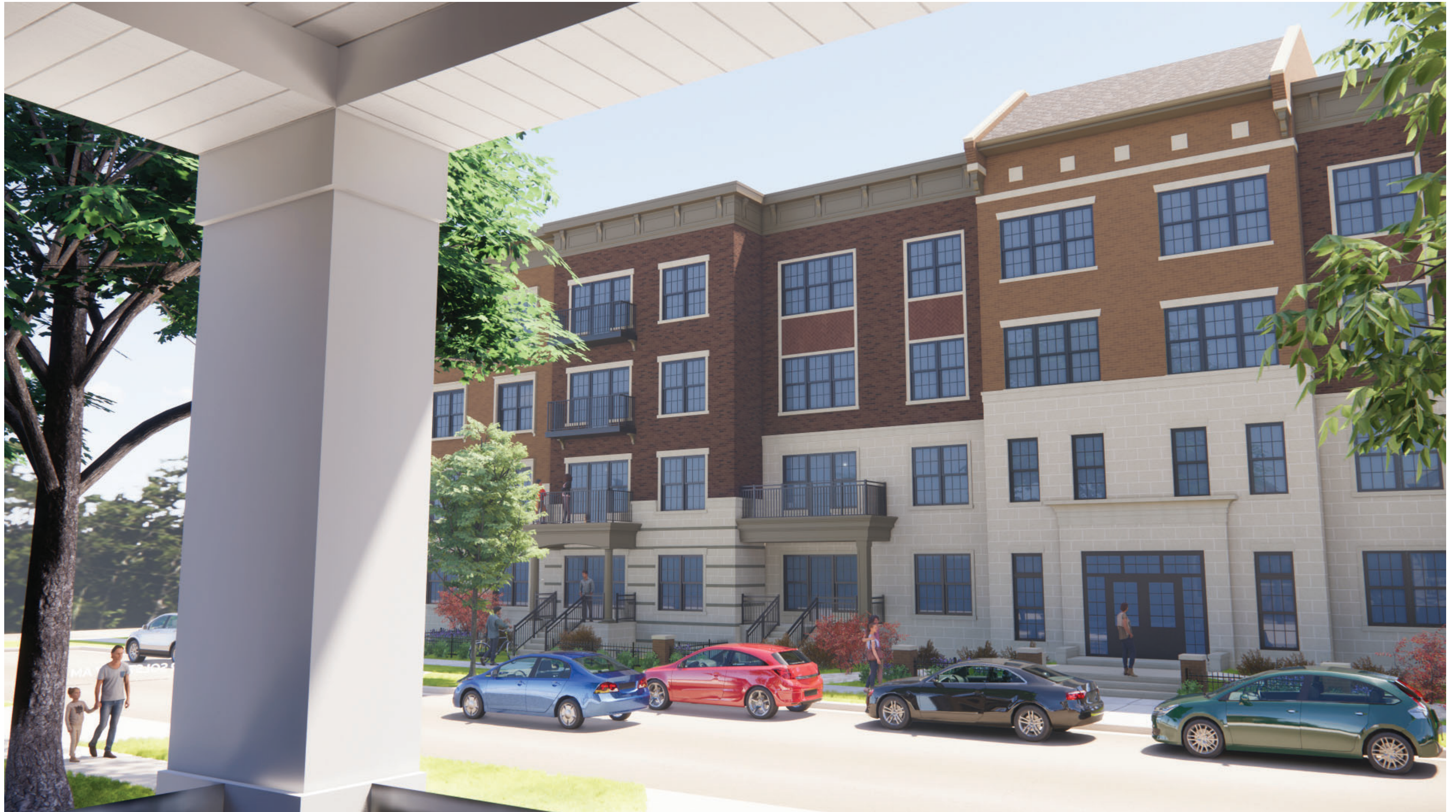
HOME OWNER'S CONNECTION TO CHESTNUT; VIEW LOOKING EAST FROM PORCH