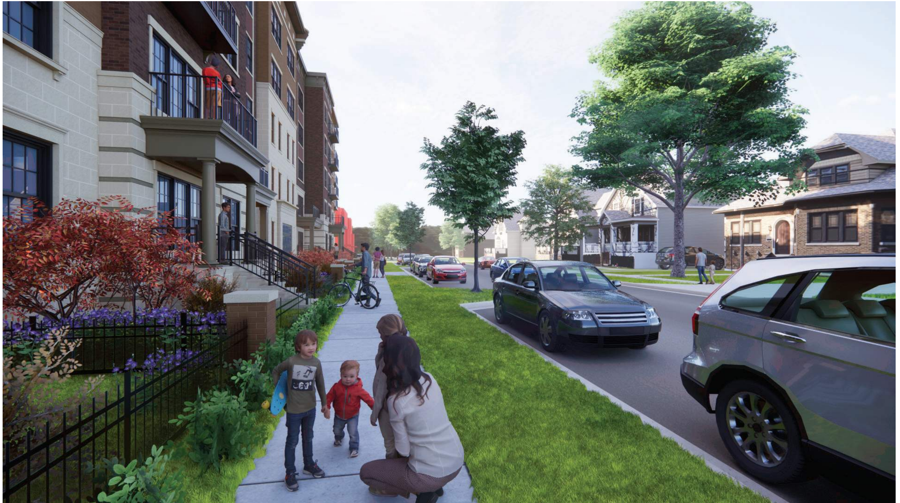
SIDEWALK VIEW LOOKING SOUTH ON CHESTNUT (3 STORY SIGWALT 16 ROW HOMES IN RED BEYOND)