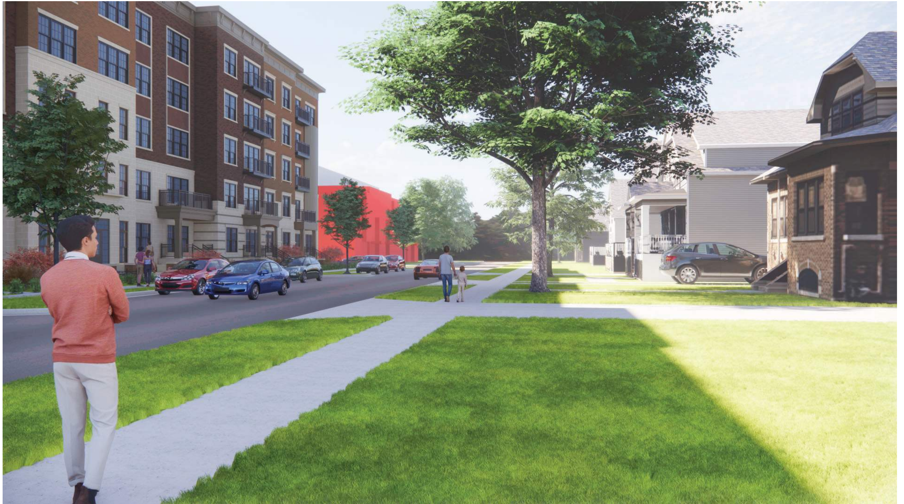
SIDEWALK VIEW LOOKING SOUTH ON CHESTNUT (3 STORY SIGWALT 16 ROW HOMES IN RED BEYOND)