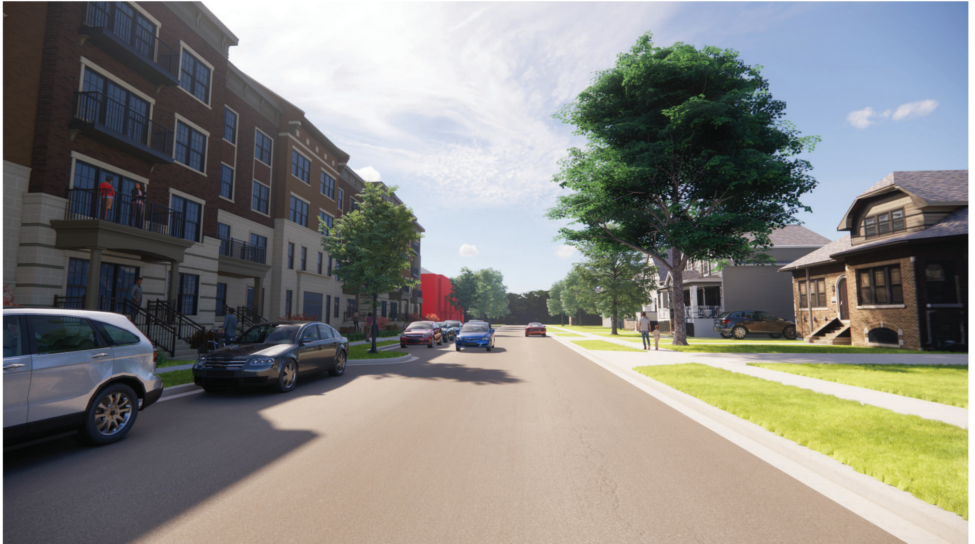
VIEW LOOKING SOUTH ON CHESTNUT T (3 STORY SIGWALT 16 ROW HOMES IN RED BEYOND)