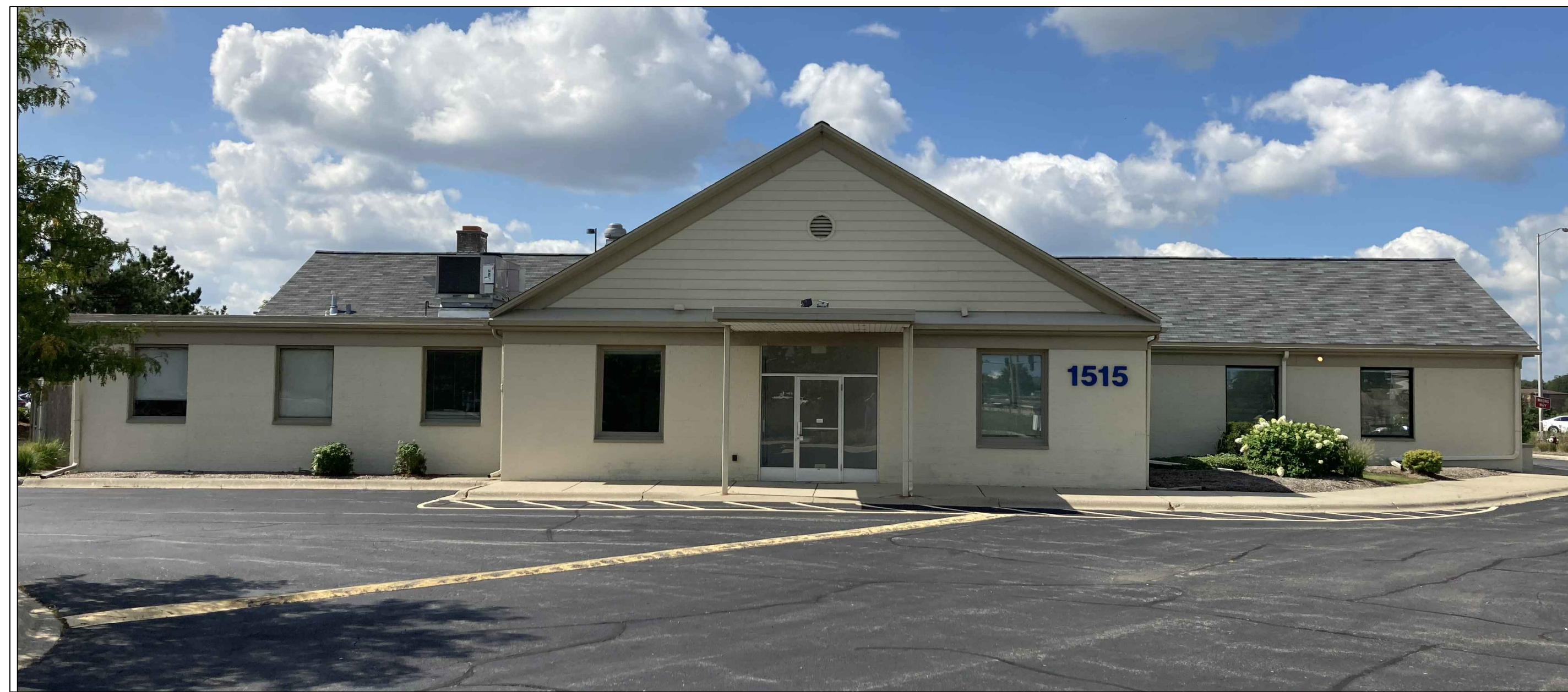
NORTH EAST FACADE