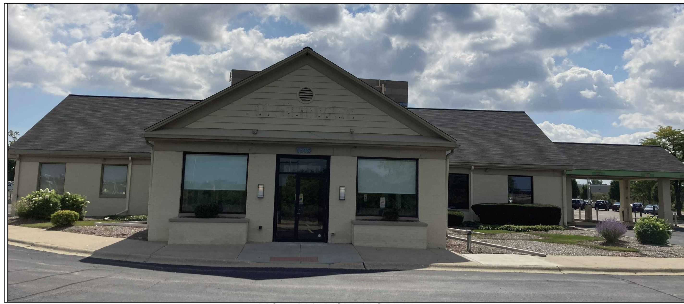
NORTH WEST FACADE