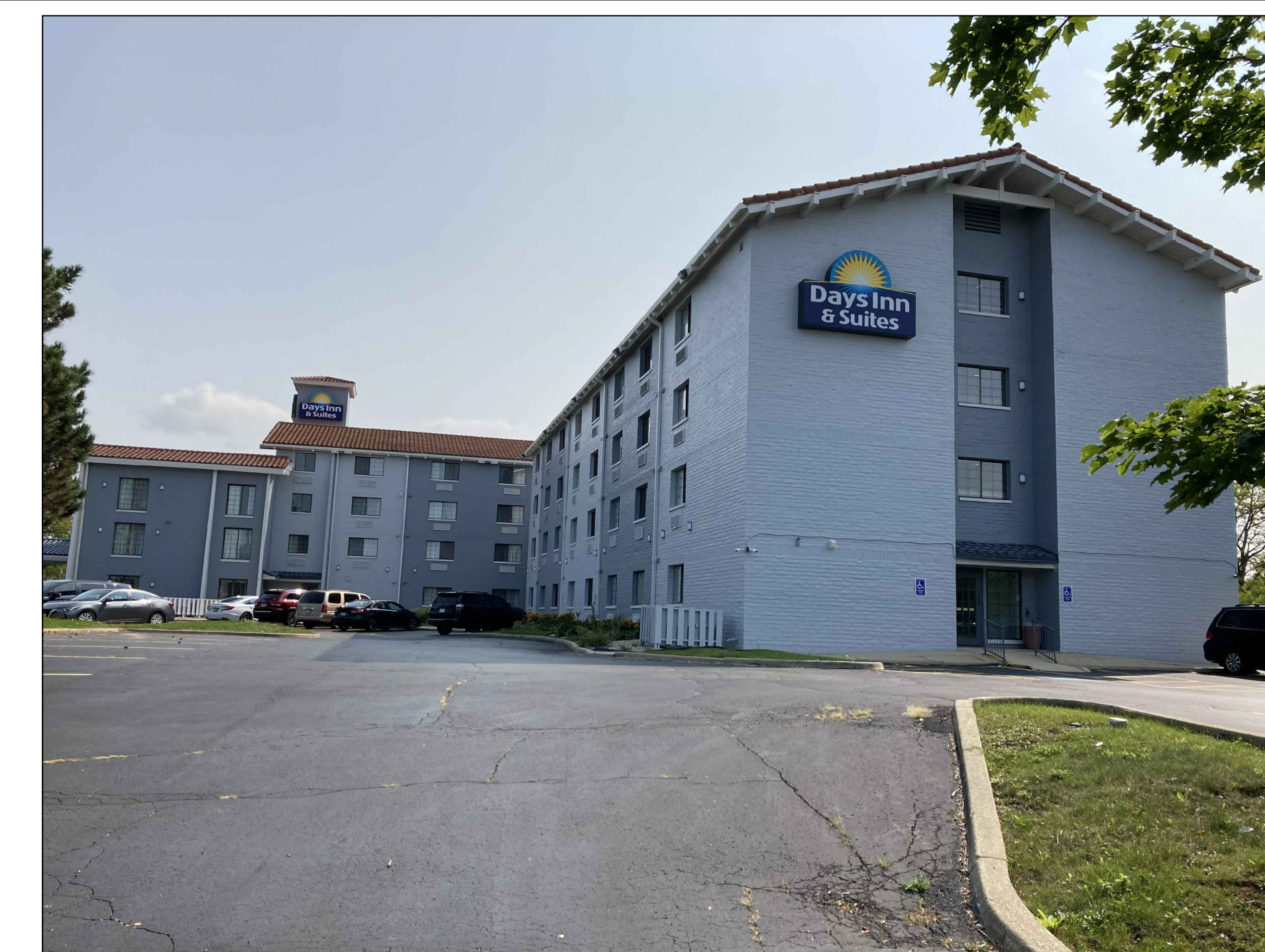
PROPERTY TO THE EAST