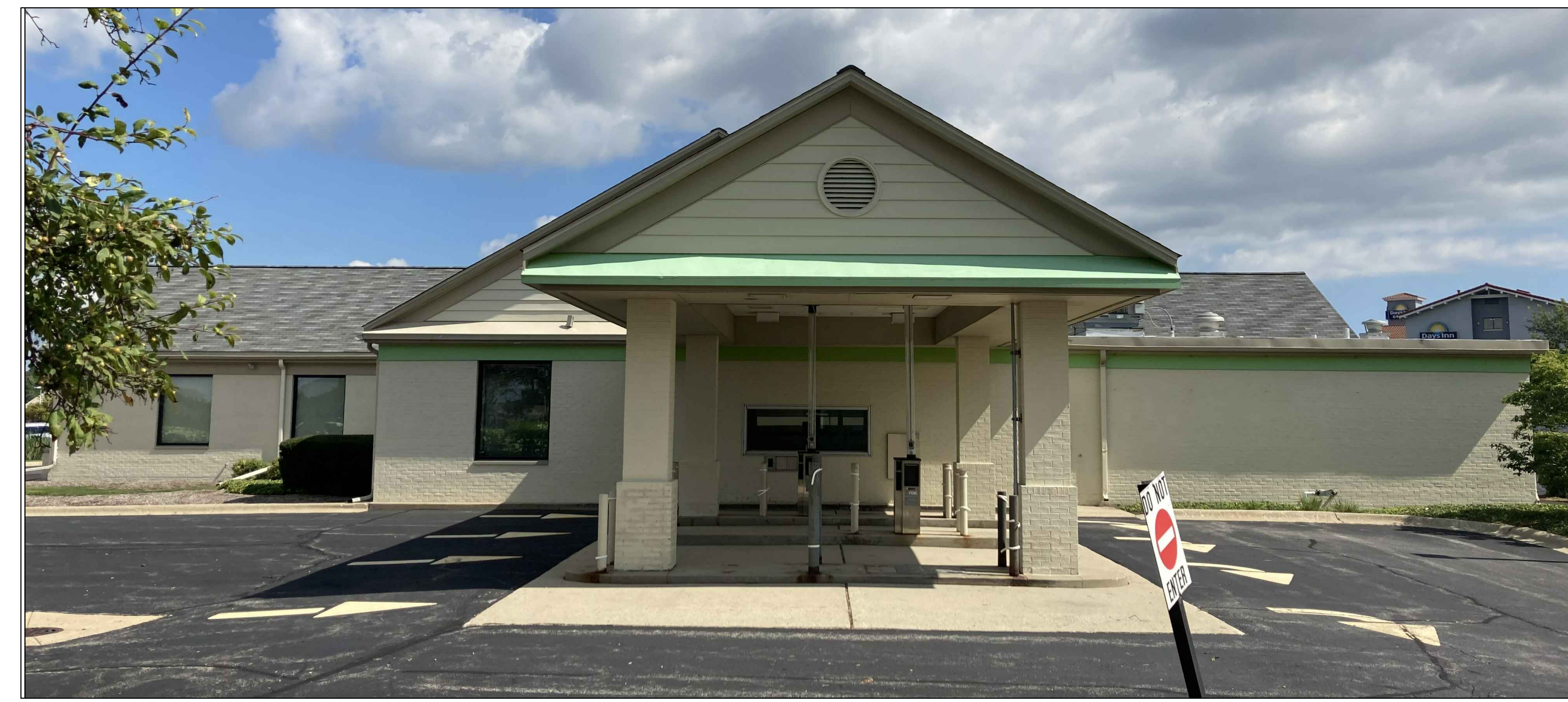
SOUTH WEST FACADE