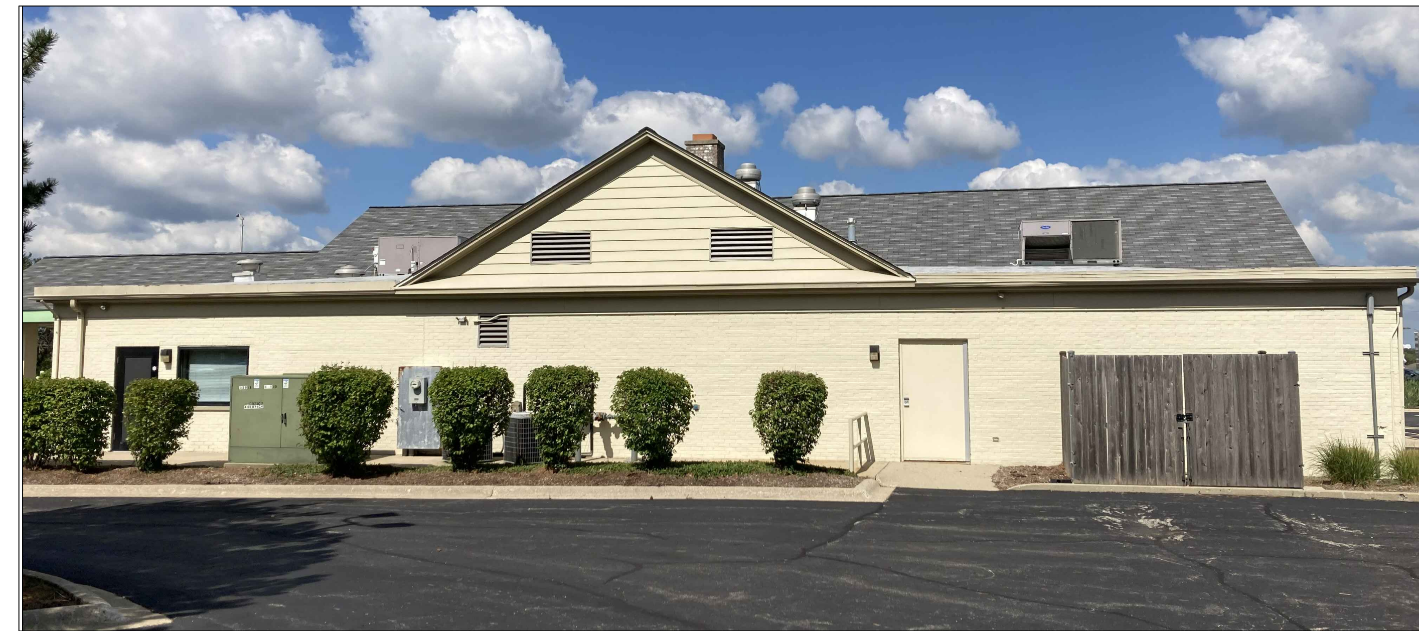
SOUTH EAST FACADE