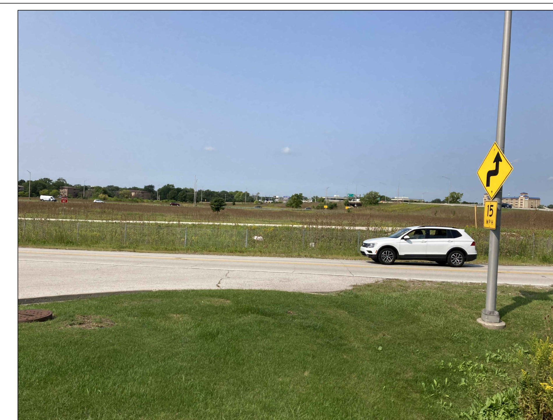
HIGHWAY 53 AND WILKE FRONTAGE ROAD TO THE WEST

ECOLE 360 CHILDCARE CENTER ARLINGTON HEIGHTS 1515 W Dundee Rd Arlington Heights, IL 60005 EXISTING PHOTOS