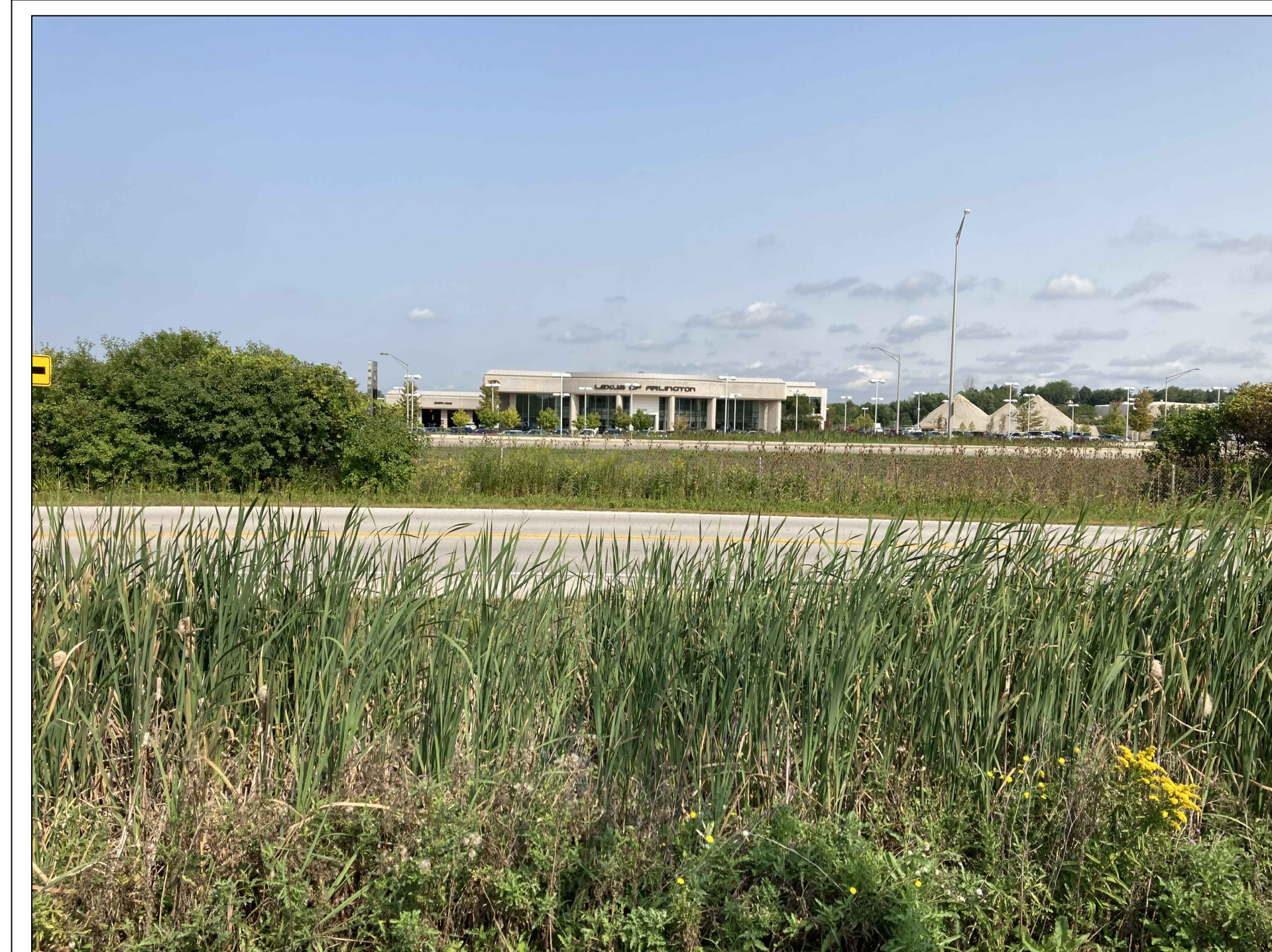
DUNDEE ROAD AND PROPERTY TO THE NORTH