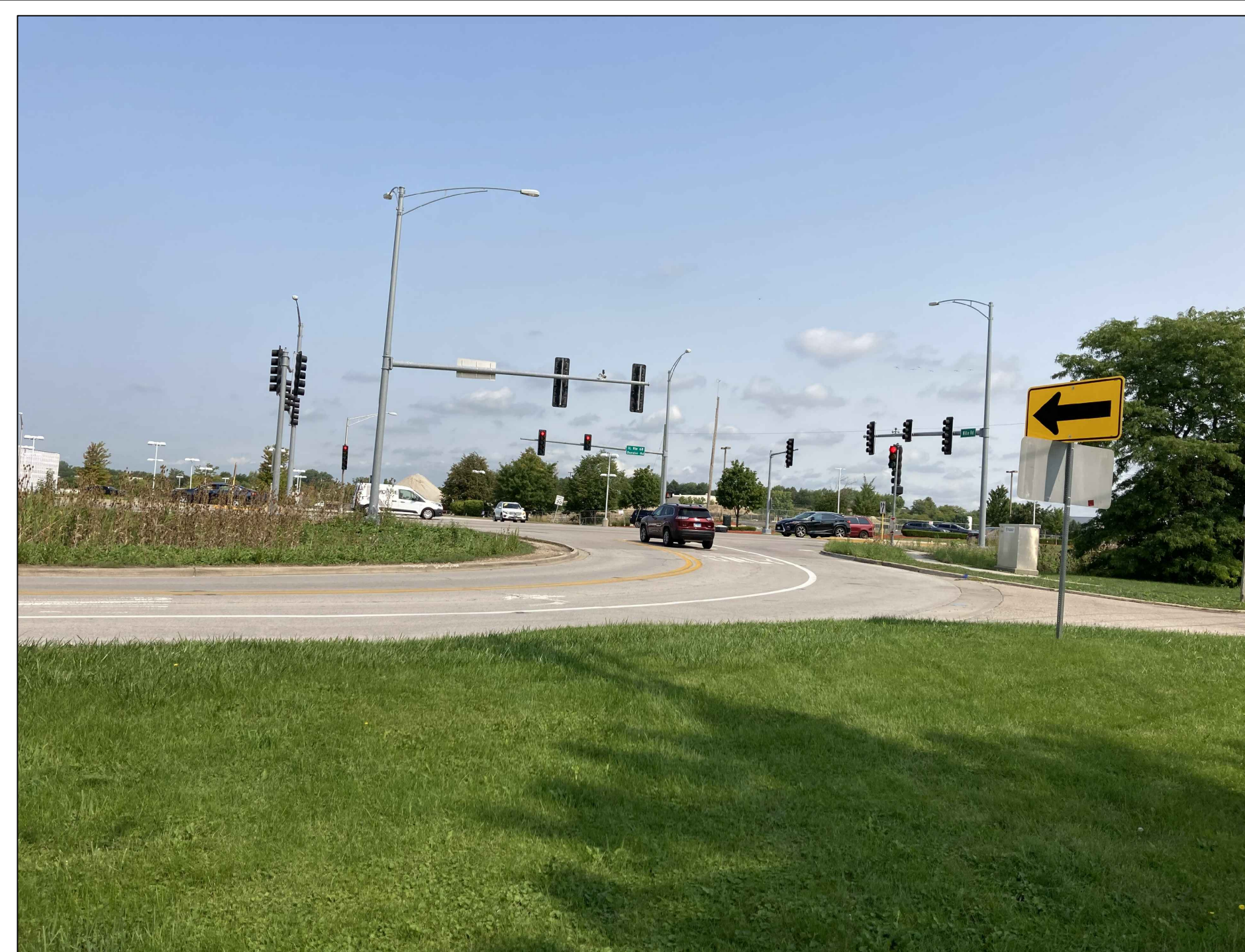
DUNDEE ROAD AND WILKW ROAD CONNECTION TO THE NORTH