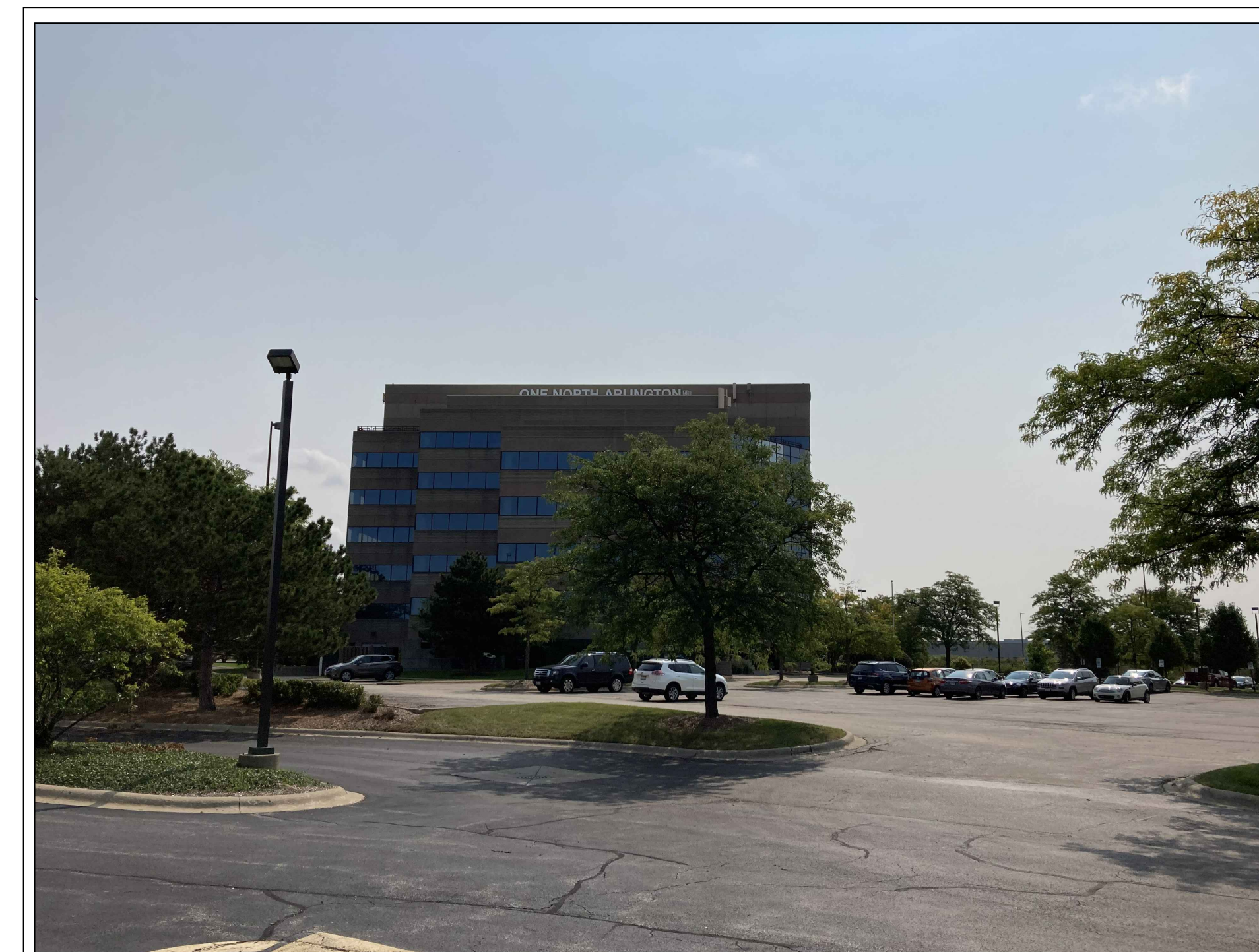
PROPERTY TO THE SOUTH