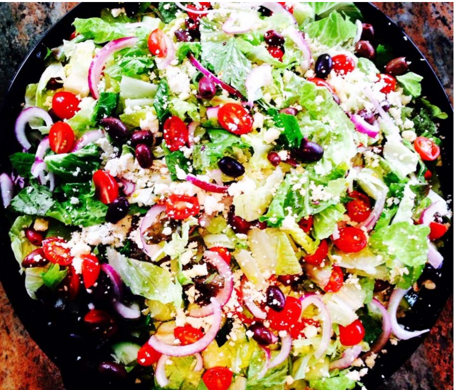
Savory Salads Inc. March 8 ing Greek salad!! Delicious! Let us feed your group! #savorysalads 10 #yummys #catering