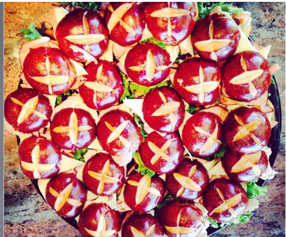
Savory Salads Inc. February 24 a little Monday catering! #savorysalads #journeycare #barrington dwichtrays #pretzelbun #60010