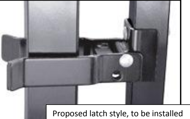
at 5' above ground.

The Park District is confident the proposed changes will meet the needs of the users and maintain, and even, strengthen the safety aspects of the project.