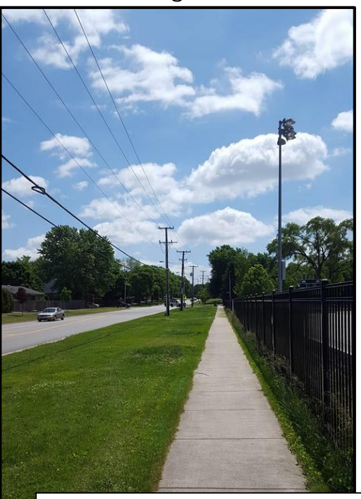
Existing parkway looking east along Kirchoff Road.