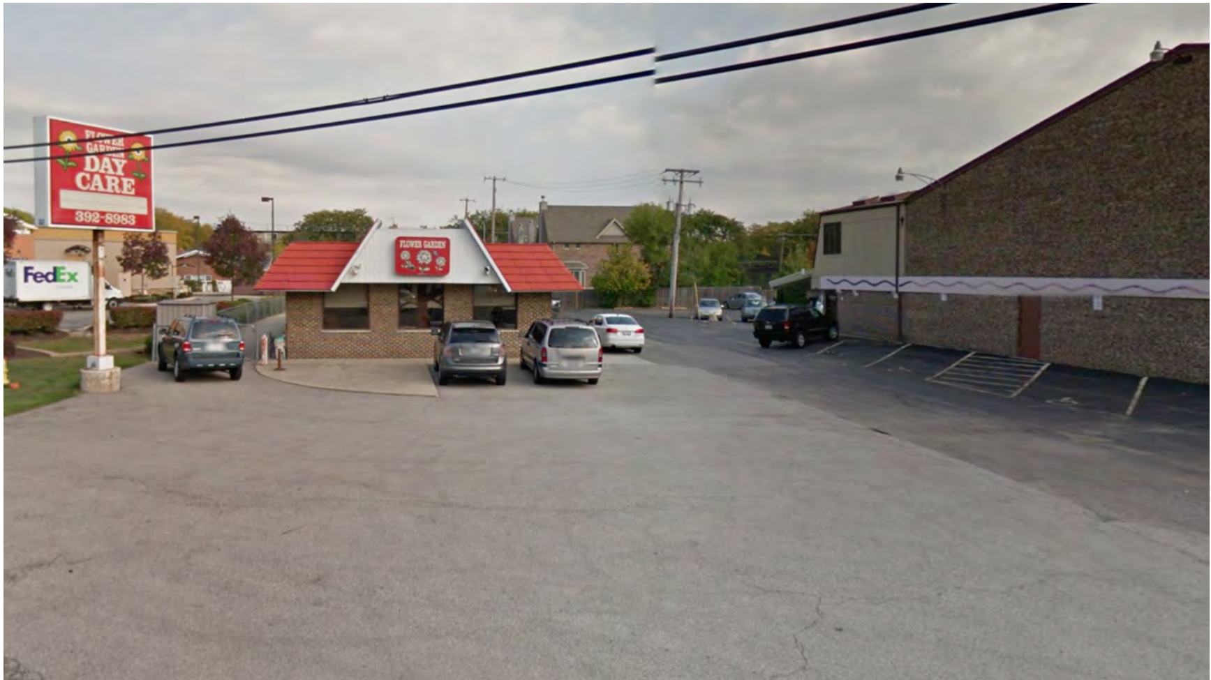
Flower Garden Day Care 2420 E Rand Road Approx. 2,500 SF Licensed Capacity 40