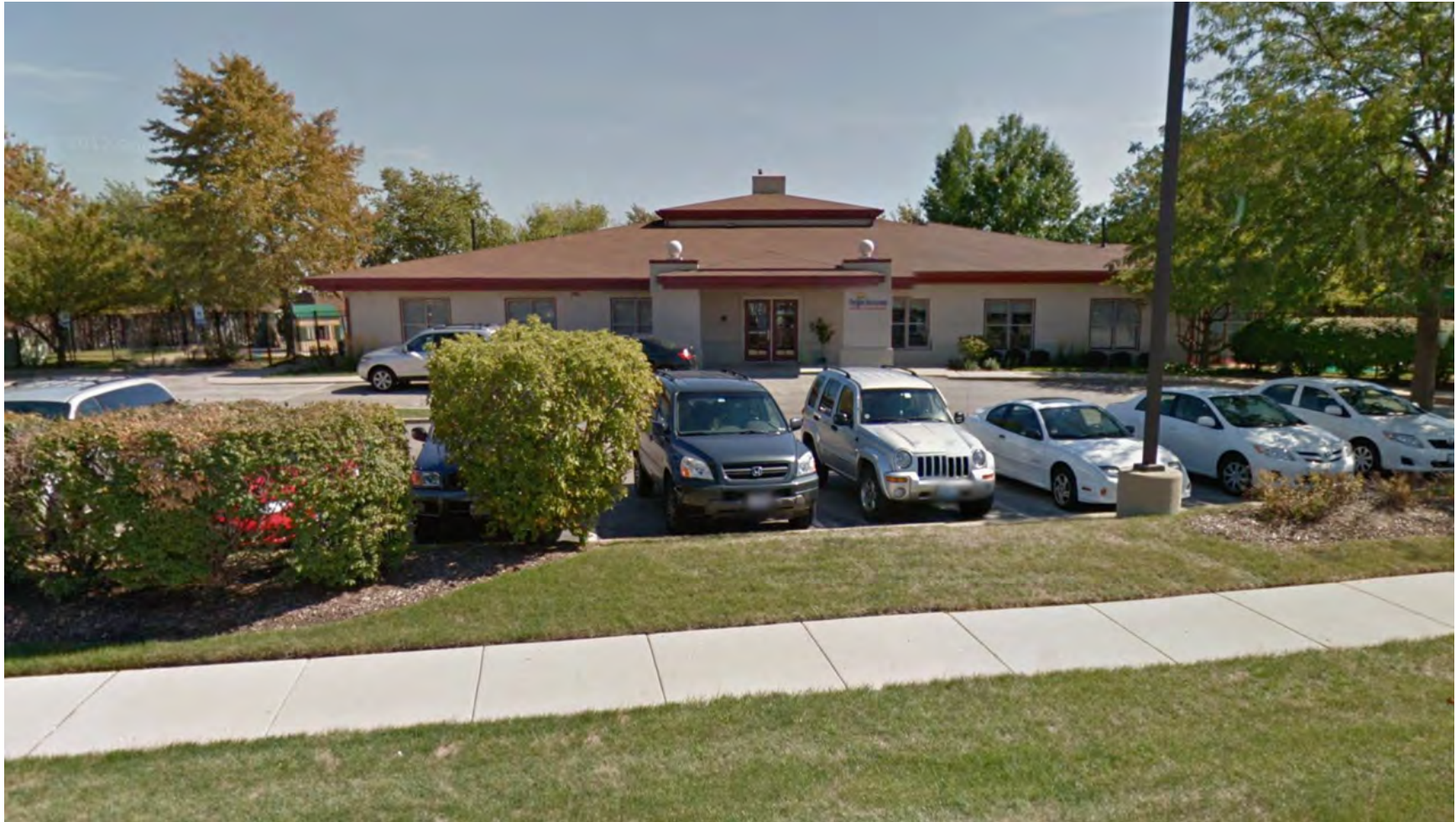
Bright Horizons 3523 N Kennicott Ave. Approx. 9,800 SF Licensed Capacity 125