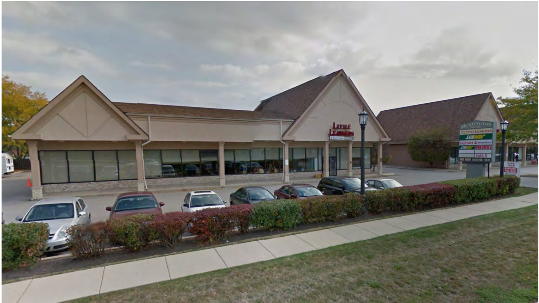
Little Learners Daycare 1060 W Rand Road Approx. 5,000 SF Licensed Capacity 126