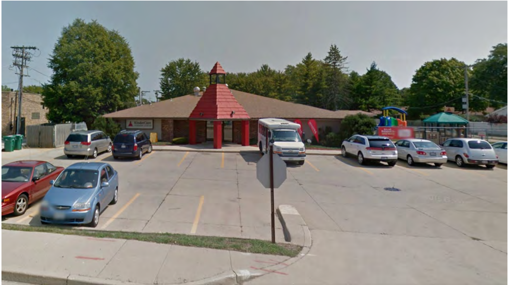
Kindercare 1003 S Arlington Heights Rd. Approx. 8,000 SF Licensed Capacity 40