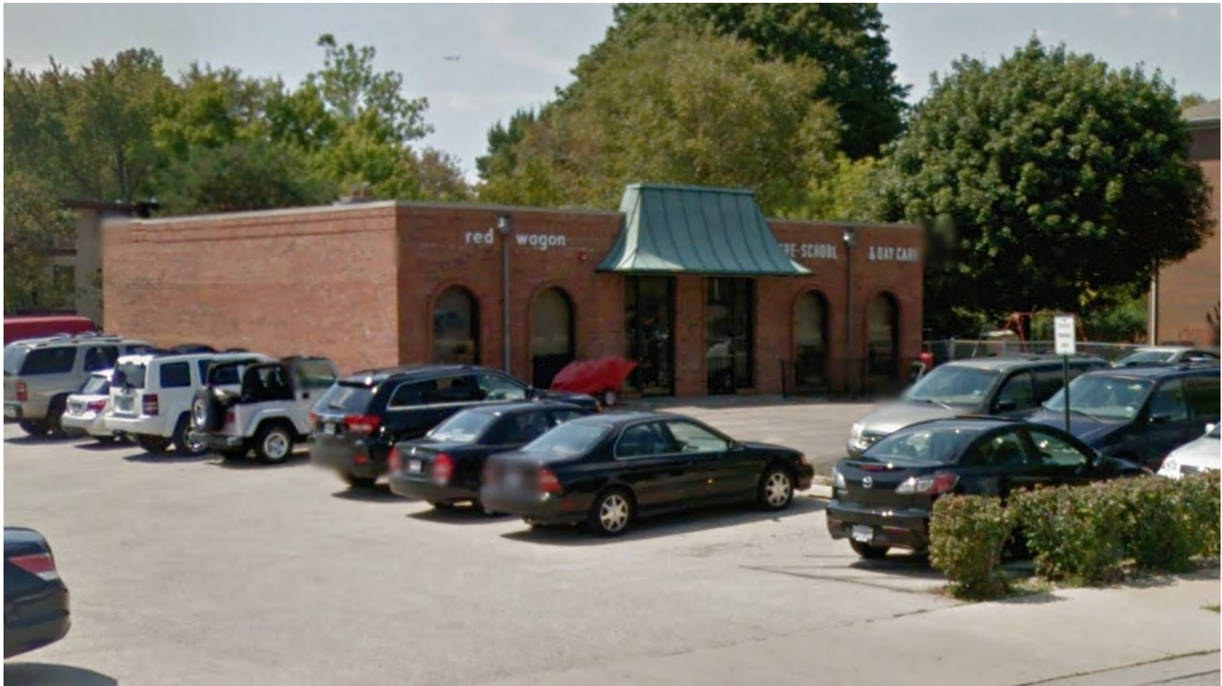
Red Wagon Preschool & Daycare 1225 E Davis St. Approx. 2,000 SF Licensed Capacity 40