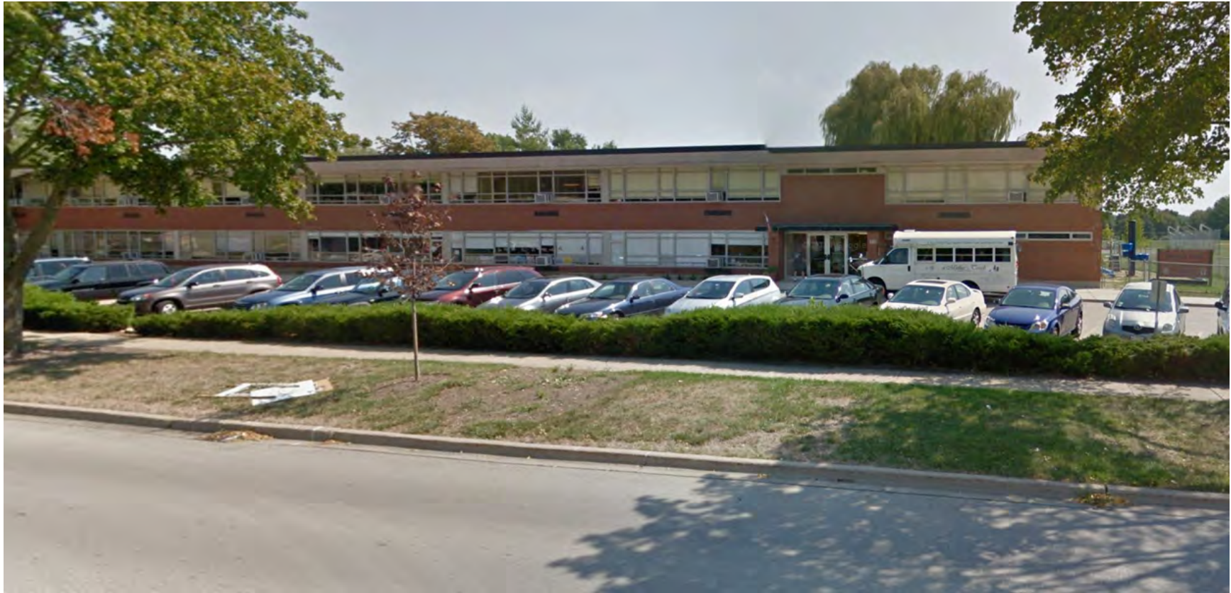
A Mother's Touch Daycare 125 N Dryden Ave Approx. 8,000 SF Licensed Capacity 178