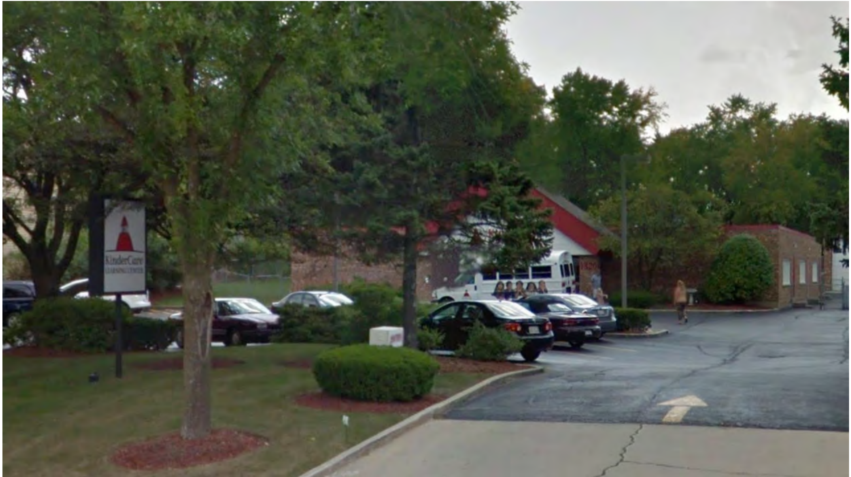
KinderCare 1320 N Arlington Heights Rd Approx. 6,800 SF Licensed Capacity 126