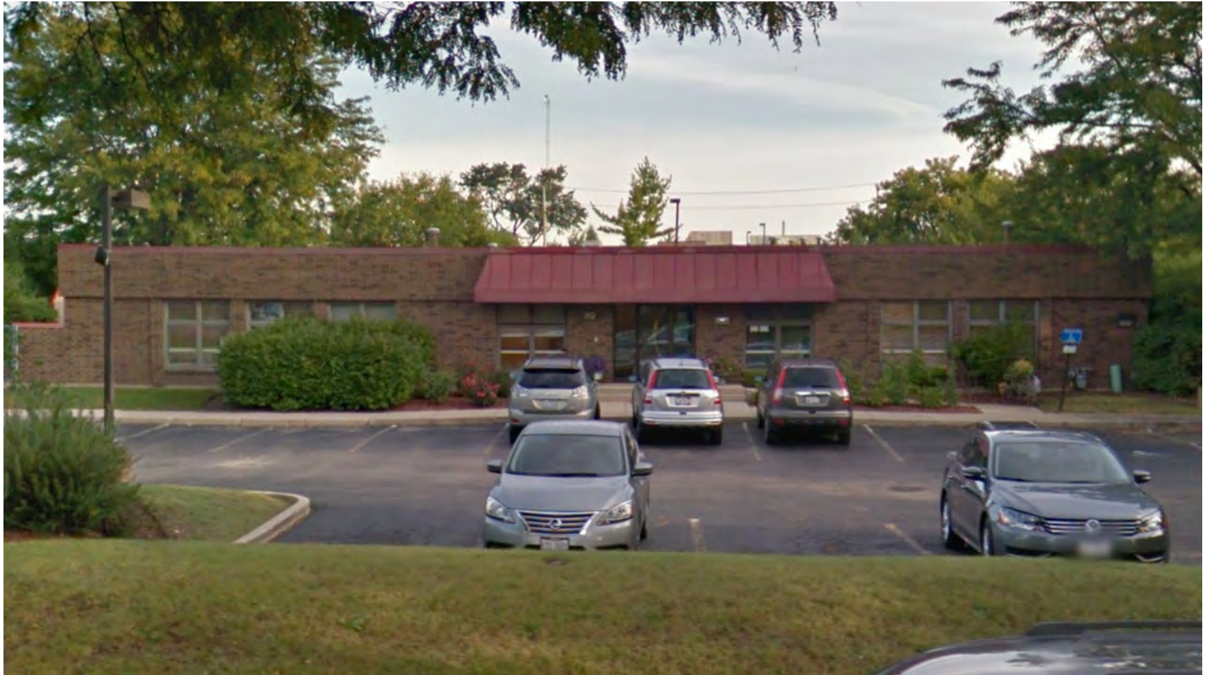
Fleur De La Zia 110 W Boeger Dr. Approx. 3,500 SF Licensed Capacity 107