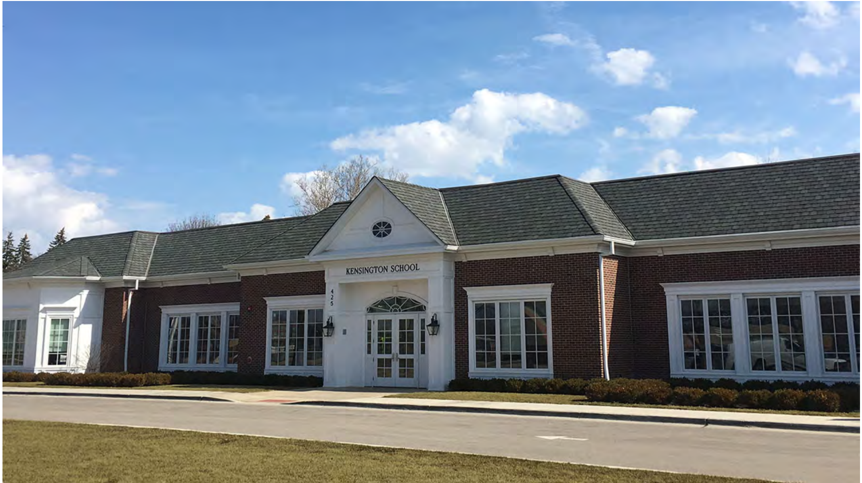
Kensington School 840 East Kensington Road 15,000 SF Licensed Capacity 160