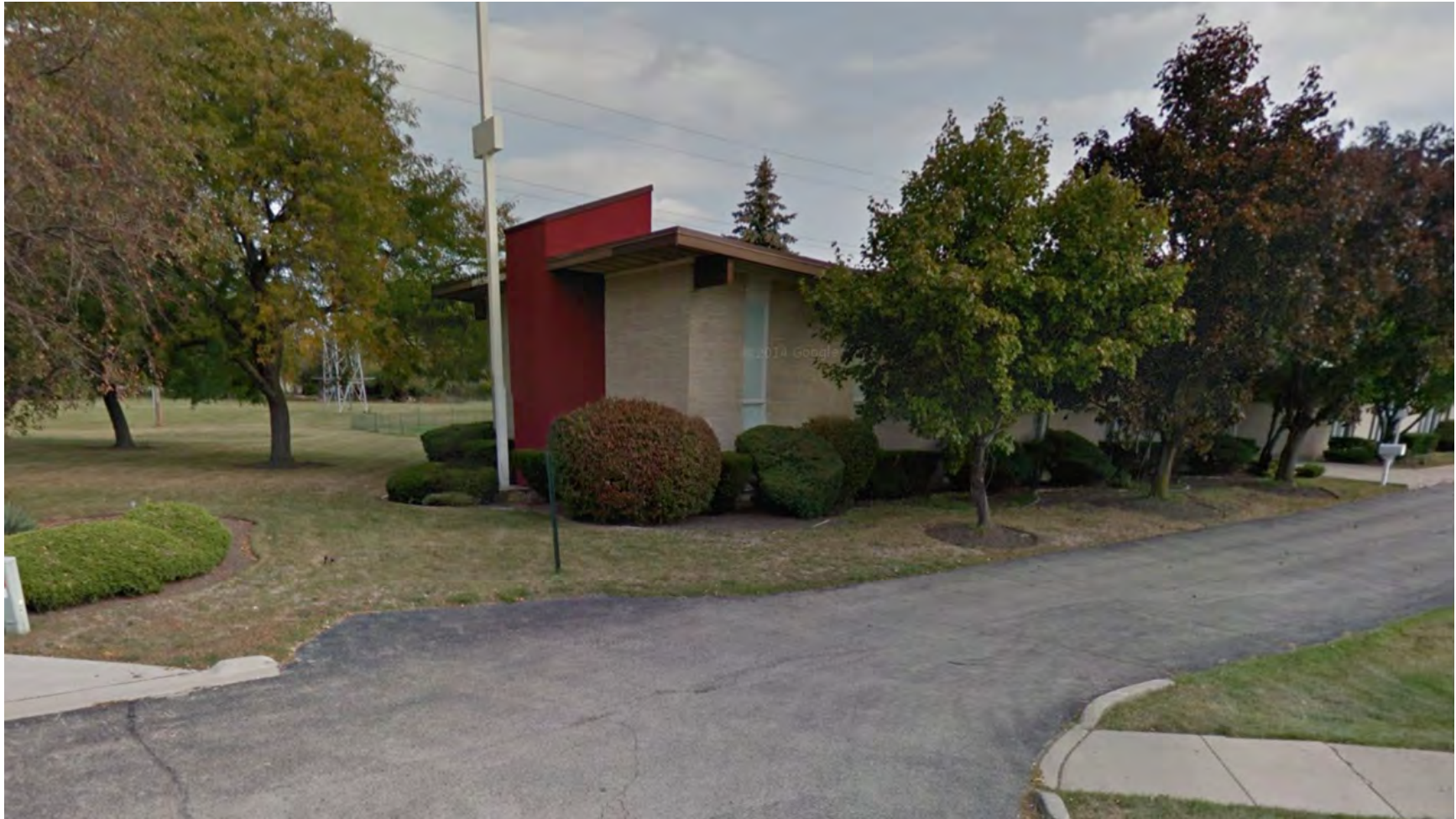
Kids of the Kingdom 1112 W Rand Road Approx. 3,500 SF Licensed Capacity 43