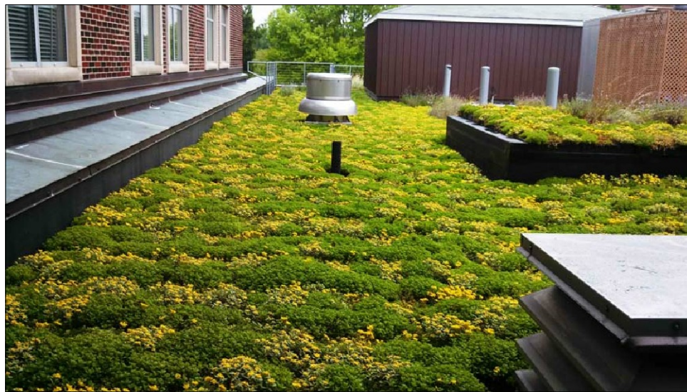
Sedum Tray & Paver Green Roof