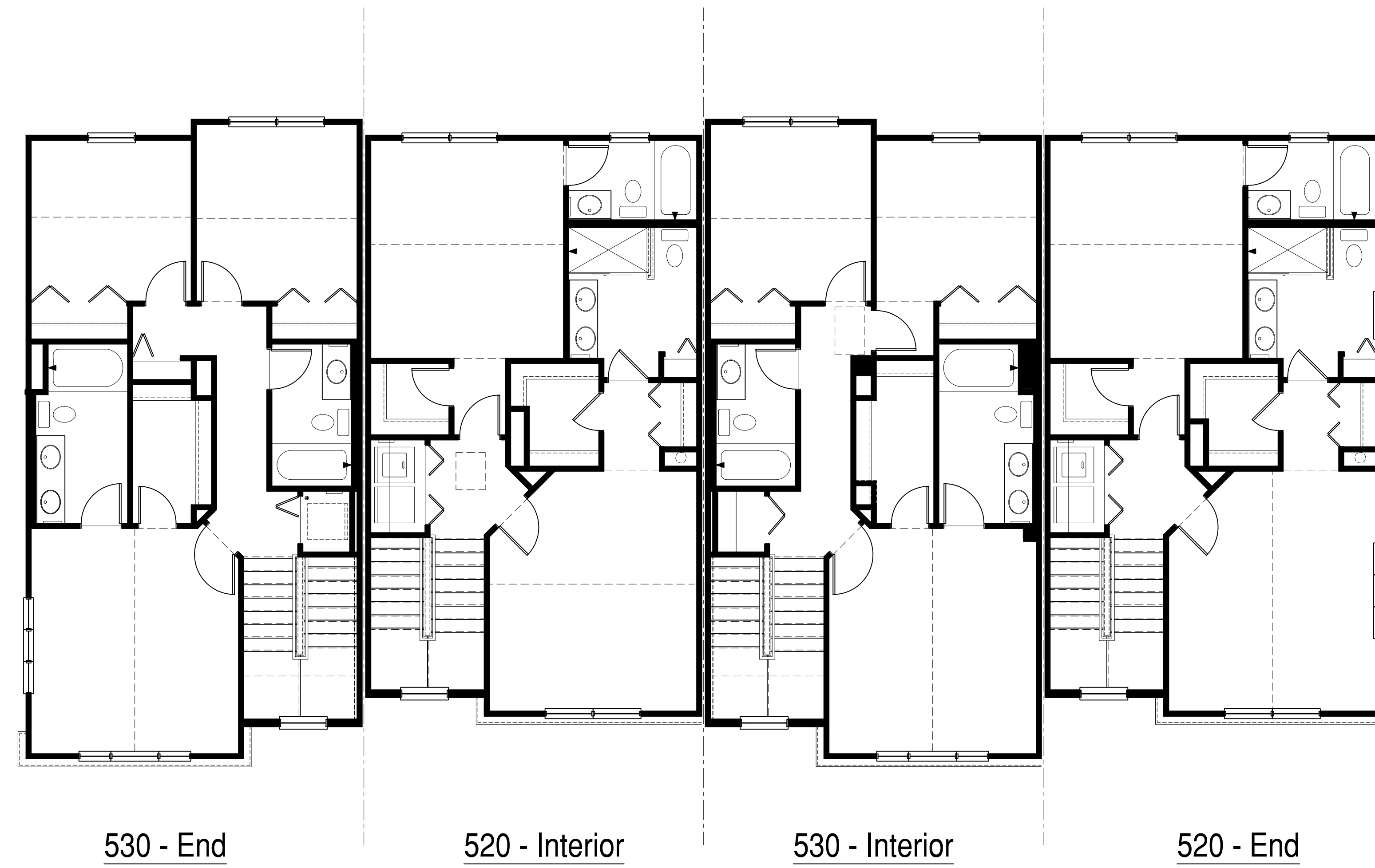
Upper Floor Plan SCALE: 3/16" = 1'-0"