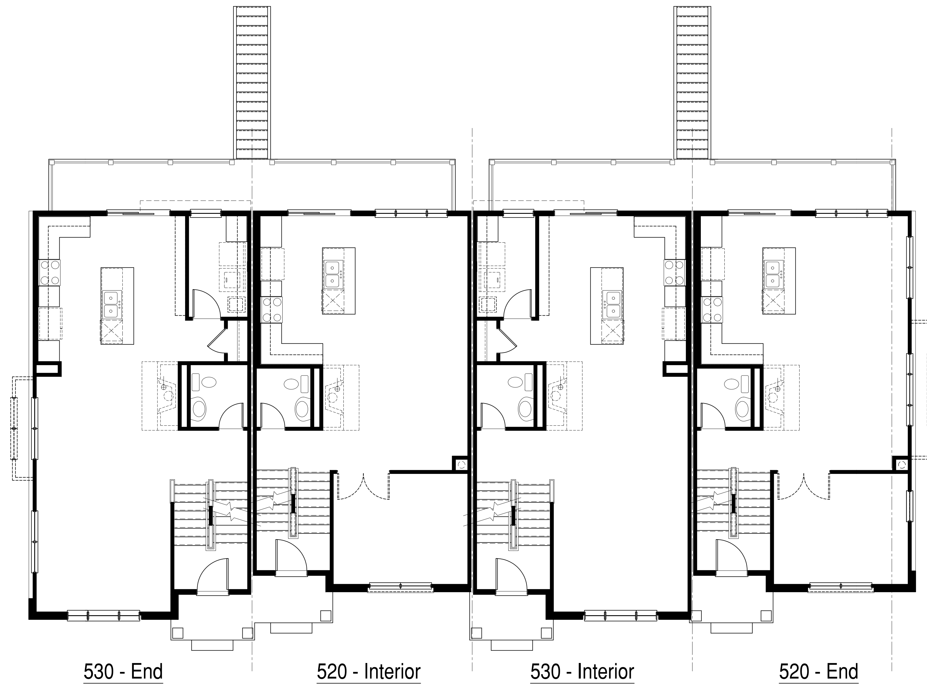
Main Floor Plan