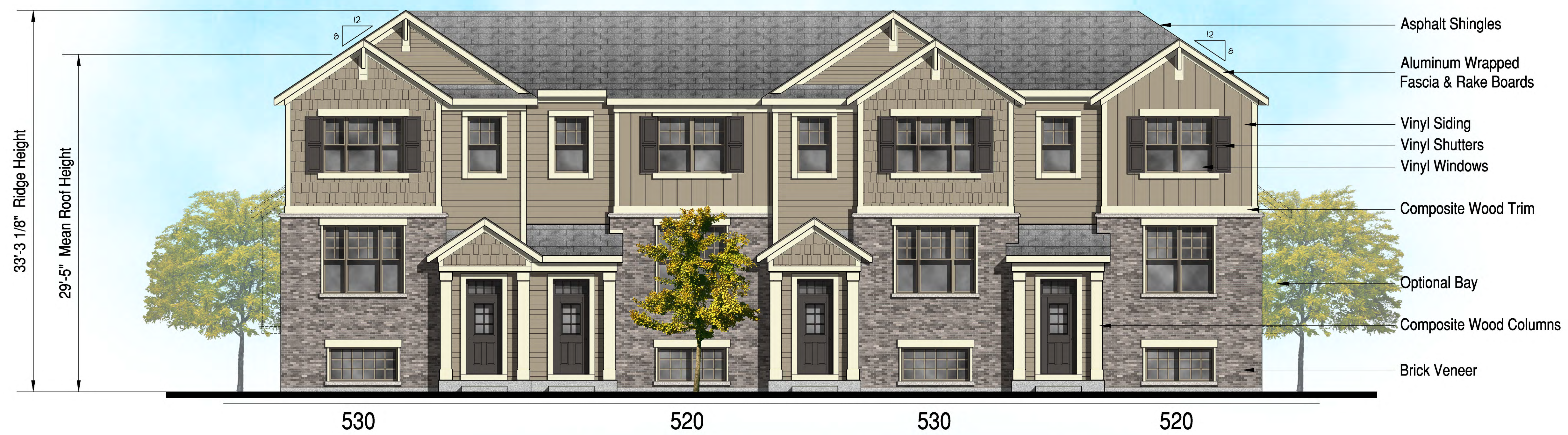
Front Elevation - Color Scheme 1