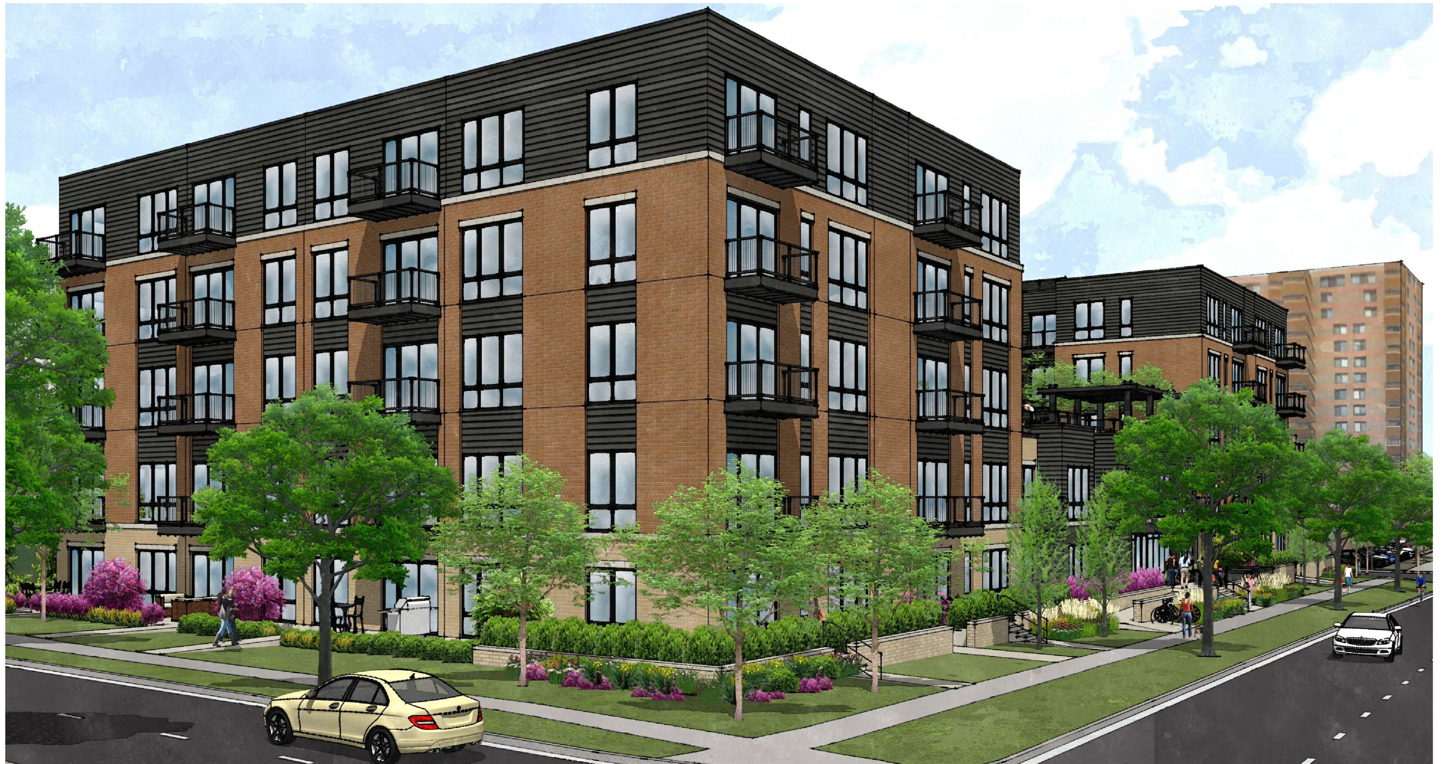
Streetscape - Sigwalt/Chestnut