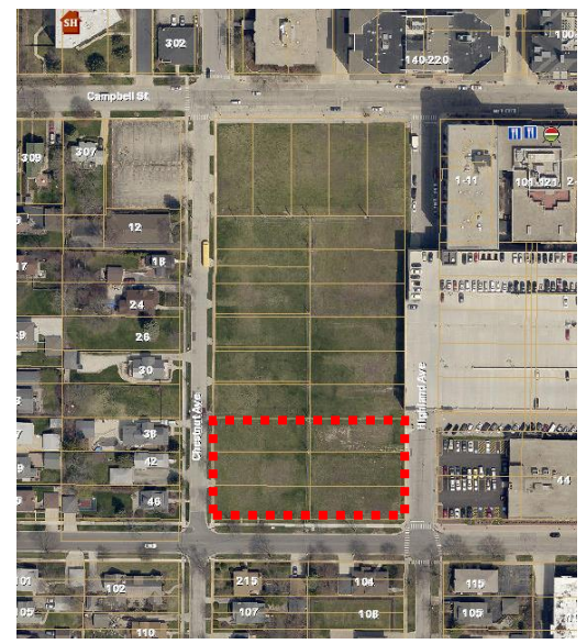
Aerial of Property